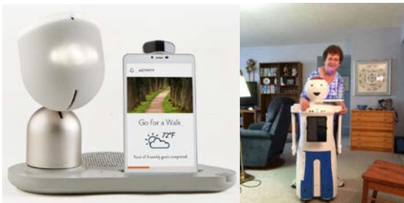
Figure 1 Elderly companion robot of ELLI-Q(Left) RUDY elderly companion robot by INF Robotics(right)

Mostly based on the smart space, the voice interaction products for the elderly are optimized and specialized according to the physiological and psychological characteristics of the elderly. The natural voice interaction system for the elderly is based on artificial intelligence, the Internet of Things, and 5G technologies, and is committed to the development of intelligent agents, providing products for elderly partners, nursing robots, and smart speakers.